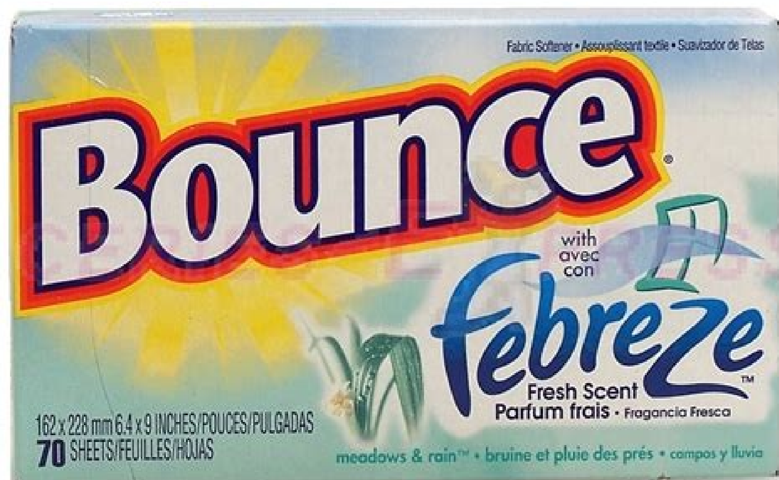
How to put sheets in dryer. Do dryer sheets make shoes smell better. Does putting dryer sheets in shoes work.